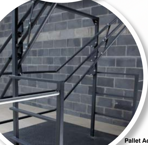
Pallet Access Gates